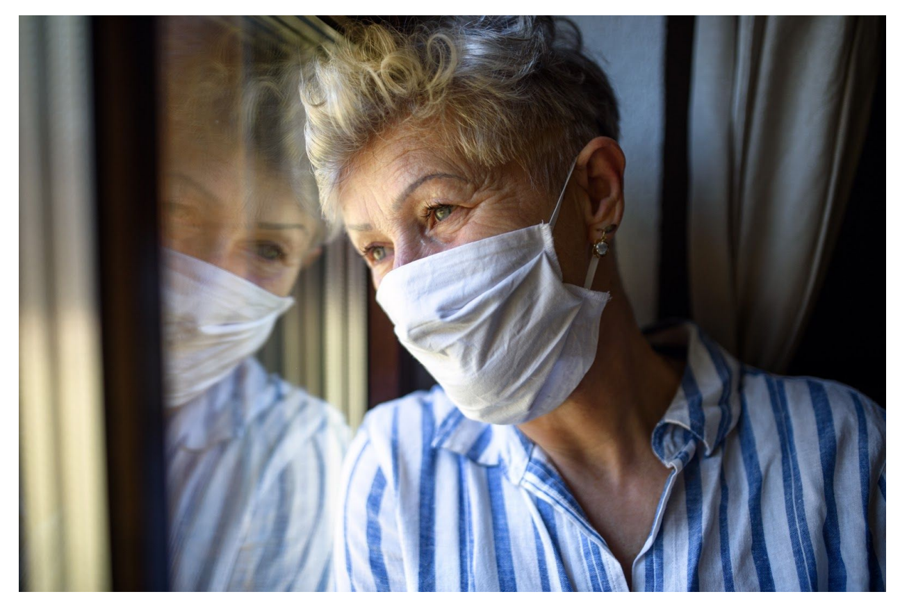
Eighty percent of all coronavirus deaths in America are people over the age of 65, and older Americans are particularly at risk from Trump's efforts to relax social distancing guidelines.

Older adults and seniors face unique risks as the country grapples with this health care crisis. According to the Centers for Disease Control and Prevention, the <u>groups</u> "at high-risk for severe illness from Covid-19" are people 65 years and older and individuals who live in nursing homes and long-term care facilities. More than 100,000 Americans have died from coronavirus, with nearly <u>80 percent of deaths</u> among those over the age of 65. Nursing homes and long-term care facilities across the country have experienced a surge in outbreaks, with about <u>one third of U.S. deaths</u> associated with these facilities.